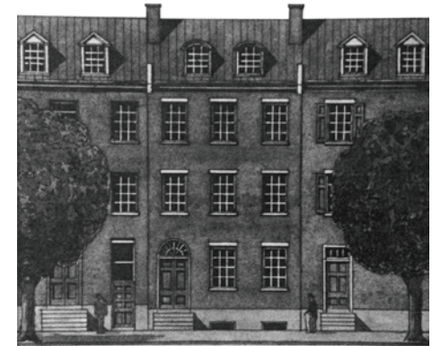
923 WALNUT STREET OCCUPIED 1889 - 1907