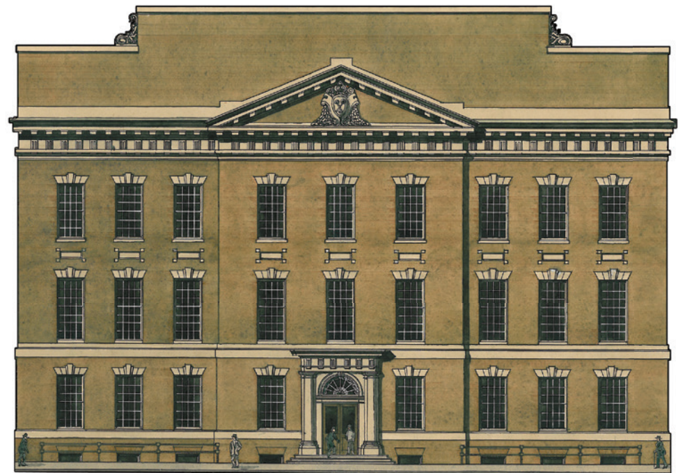
215 SOUTH 16TH STREET OCCUPIED 1907 - PRESENT

In this building there were two Racquets Courts, and the first regulation singles Squash Racquets Court in Philadelphia.